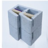
12" Acoustade QUOTE