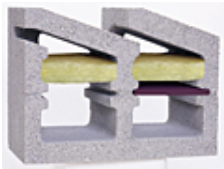
8" Acoustade QUOTE